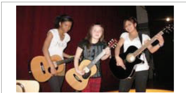
Making the Band at Lafayette

performed with guitars, bass, piano, and vocals by both students and teachers, a fantastic juggling act by a Russian student, and a skit about traditional West African family life.